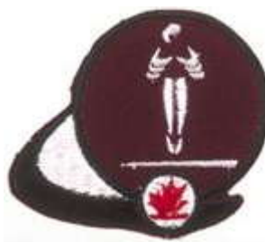
CanSkate Badge - Jump